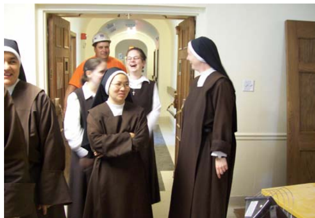
The Sisters take a walk-through of the construction site.

Thursday morning arrived and ...continued on page 2