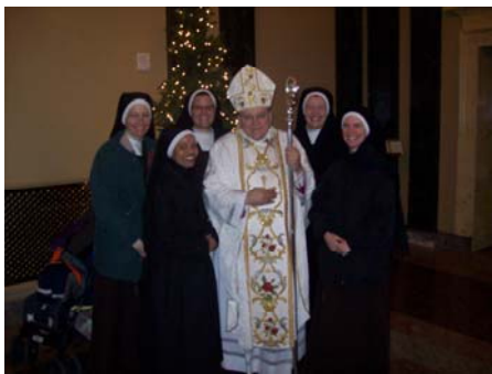
An extra treat – an opportunity to greet Archbishop Burke following the Mass on December 12!