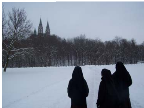
The Sisters take a last look at Holy Hill before departing. After a glorious pilgrimage filled with blessings, it is time to return home to St. Louis.