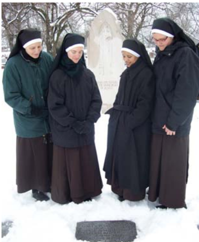
The Sisters say a prayer, asking Sr. Teresa’s intercession that they too may live their lives completely dedicated to Our Lord after the example of Our Lady, with a great willingness to suffer for the salvation of souls.