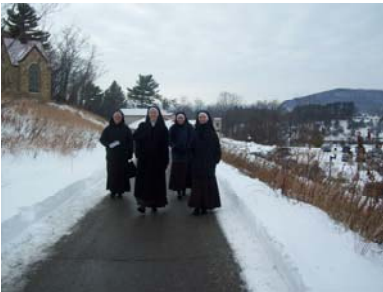
December 12, the feast of Our Lady of Guadalupe – the Sisters head up the walk to the Shrine of Our Lady of Guadalupe, La Crosse, Wisconsin.