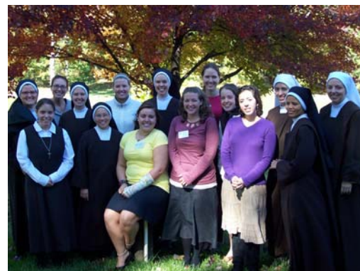
Above: 2009 October Holiness Retreat

Register now... Holiness Retreat March 20-21